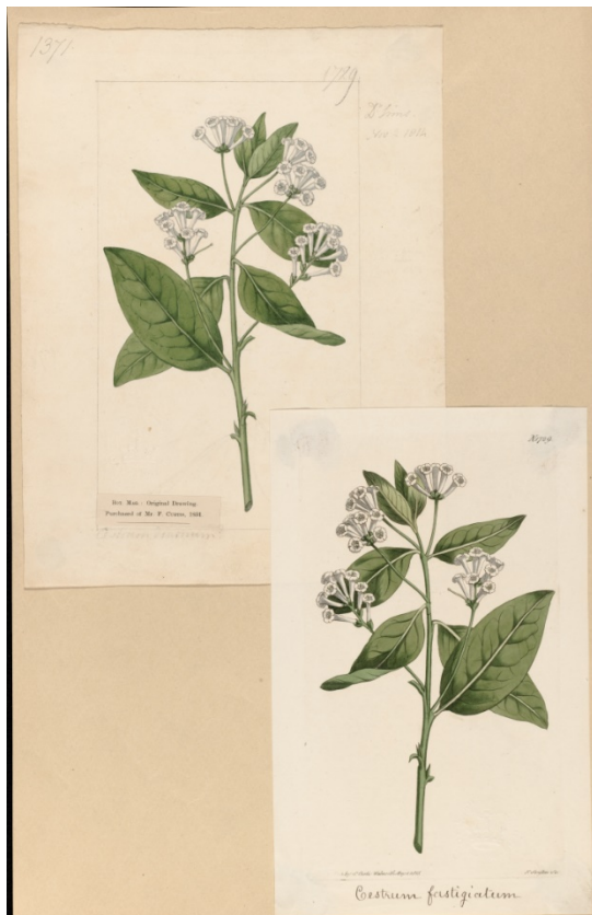
Cestrum fastigiatum , watercolour drawing and hand-coloured plate, 1815

The name of this shrub gives us a clue to its characteristics; the epithet aphylla means 'leafless' in Latin, although Curtis's Botanical Magazine informs us that this is only the case in the mature plant. In 1815, when this plate was published, the species had already been in England for 125 years, having been cultivated in the royal garden at Hampton Court in 1690.