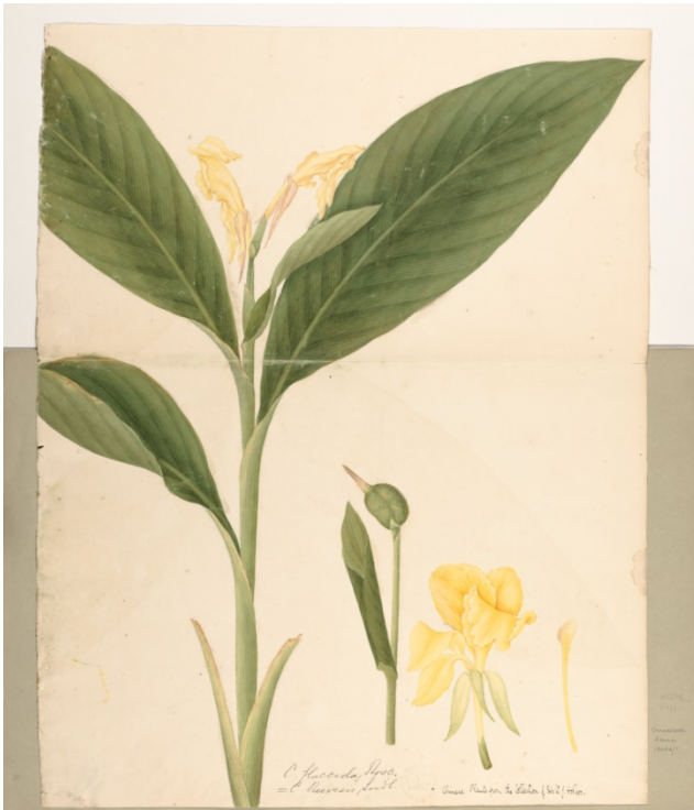
Canna flaccida , painted by a Chinese artist, late 18 th or early 19 th century

This painting, by an unidentified Chinese artist, formed part of a collection by Kew's first Director, William Jackson Hooker, and was probably sent to him by a correspondent stationed in China in the mid-1800s.