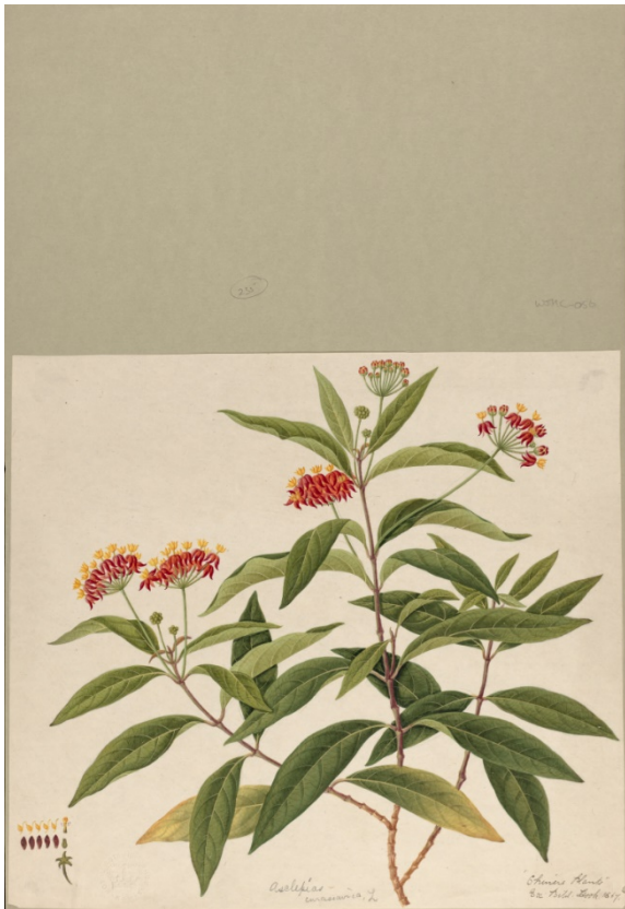
Asclepias curassavica , painted by a Chinese artist, late 18 th or early 19 th century

This painting, by an unidentified Chinese artist, formed part of a collection by Kew's first Director, William Jackson Hooker, and was probably sent to him by a correspondent stationed in China in the mid-1800s.