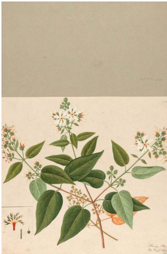
Unidentified specimen, possibly from the family Annonaceae, painted by a Chinese artist, late 18 th or early 19 th century

Asclepias curassavica is an ornamental evergreen shrub that has been used both as a medicine and a poison. It is interesting that although native to Mexico and Tropical America, it was clearly being cultivated in China by the early 1800s.