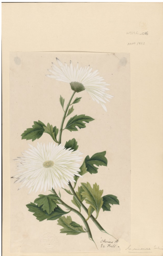
Chrysanthemum sinense , painted by a Chinese artist, late 18 th or early 19 th century

It is interesting to consider that although native in the south-east region of the United States, this specimen of Canna flaccida was painted in China. Further research is required to decide when and how the species was arrived in China, but it is not widely found in the region today.