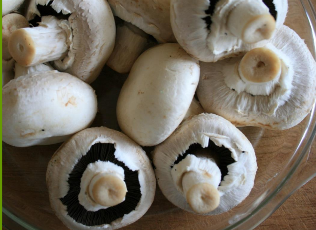
Agaricus bisporus Common mushroom

Endeavour HERITAGE FUND Kew Royal Botanic Gardens