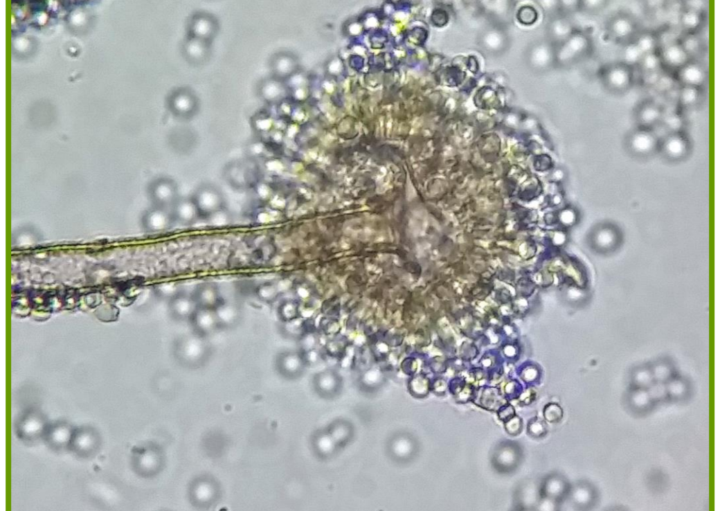
Aspergillus flavus Itaconic acid from Aspergillus fungi is used to make Lego, synthetic rubber and plastic car parts

Endeavour HERITAGE FUND Kew Royal Botanic Gardens