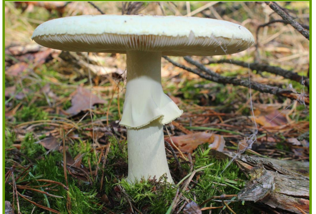
Amanita phalloides Deathcap