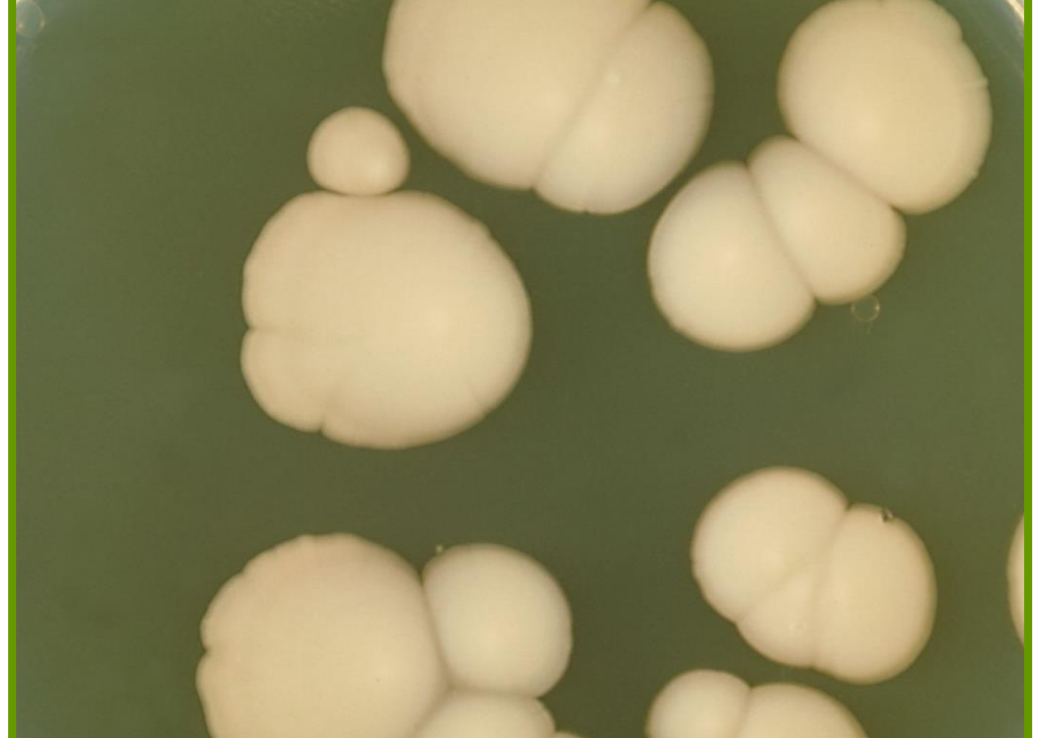
Candida albicans Yeast found in the human body