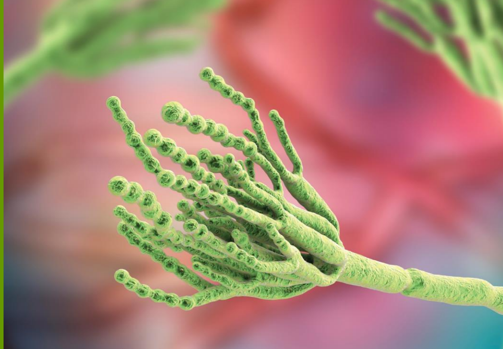
Penicillium sp. Some Penicillium fungi produce penicillin