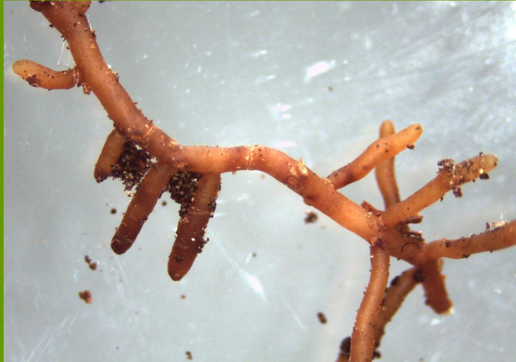
Mycorrhizal fungi Helps plant roots to absorb water and nutrients