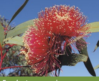
Eucalyptus youngiana

Five years on, Australia continues to contribute to MSBP seed banking targets and is currently collecting for Kew and the Garfield Weston Foundation's Global Trees Programme. Some of the Australian Seed Bank Partnership's other priorities include: