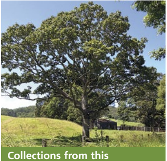
Collections from this roadside remnant of Gmelina leichhardtii in New South Wales were made as part of Kew and the Garfield Weston Foundation's Global Trees Project