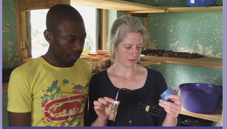
Testing the relative humidity of seeds using a TinyTag Data logger, Plant Genetic Resources Research Institute, Ghana

Funded by the Toyota Environmental Activities Grant Program, this project enables capacity building and technology transfer across the MSBP and is now halfway through its cycle. To date the initiative has supported a wide variety of work to meet these aims.