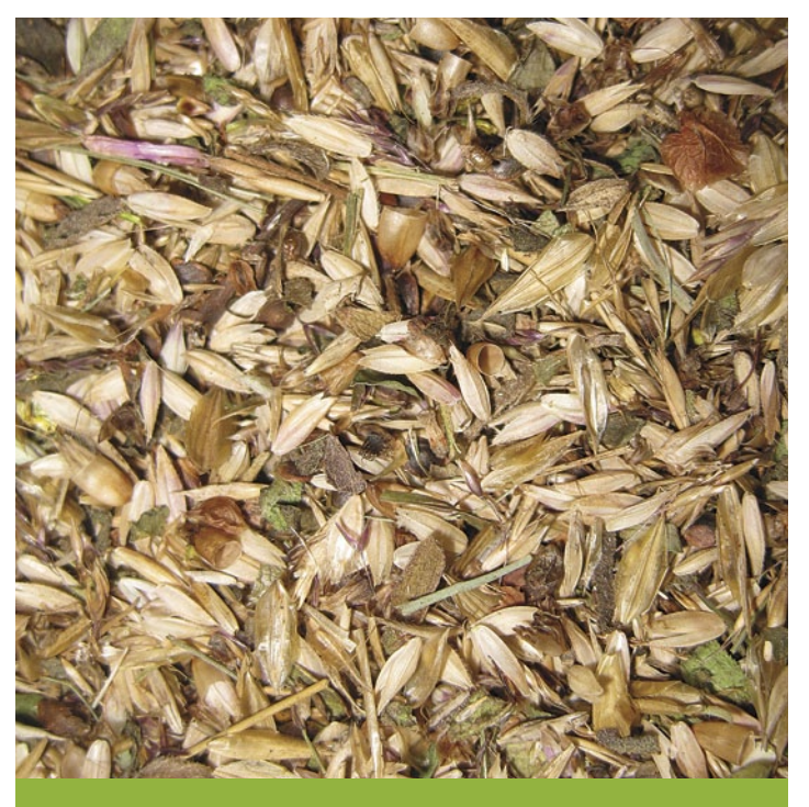
Seed mixtures, agricultural or wild can be a problem. Seed identification to species level is what ISTA laboratories do on a daily basis. Applying pure seed definitions to determine what is seed and what is chaff (inert matter) is just one part of the ISTA Rules.

The germination test is designed to determine the maximum potential germination of the seed lot. Germination is assessed using specified temperature and light regimes, and suitable germination media, which minimise, or eliminate, biotic stress. Germination% on an ISTA certificate is