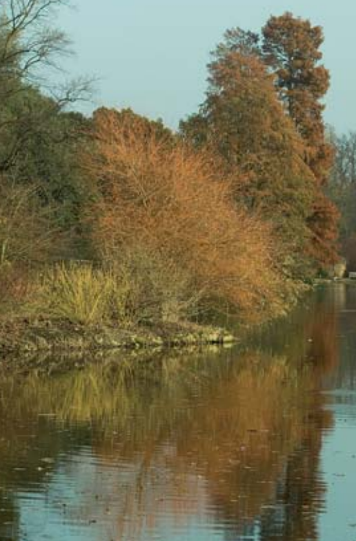
Autumn colour reflected in the Lake

to provide an 'open flow of water through a portion of the pleasure grounds'. Situated toward the Thames in the west of the Gardens, the Lake was formed by extending and filling the gravel pits excavated to provide spoil for the foundations of the Temperate House. The Sackler Crossing is the first walkway across the Lake. It provides a new route through the Gardens and allows a closer appreciation of the lakeside planting and wildlife as well as the surface of the water itself.